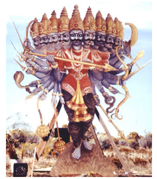
Title: Ravana's side of the story.